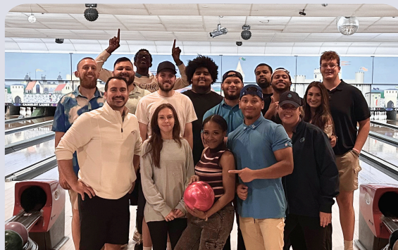
BOWLING TEAM NIGHT